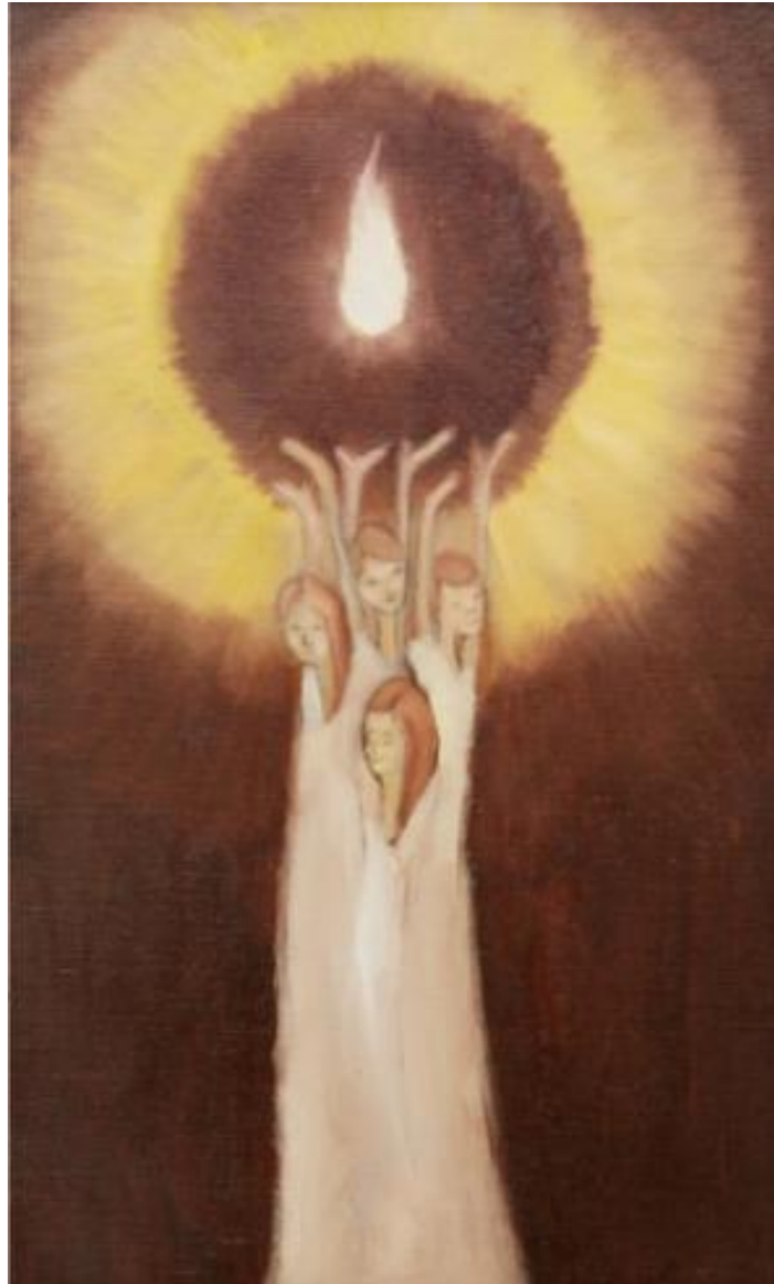
The Beacon by Abigail Henrie