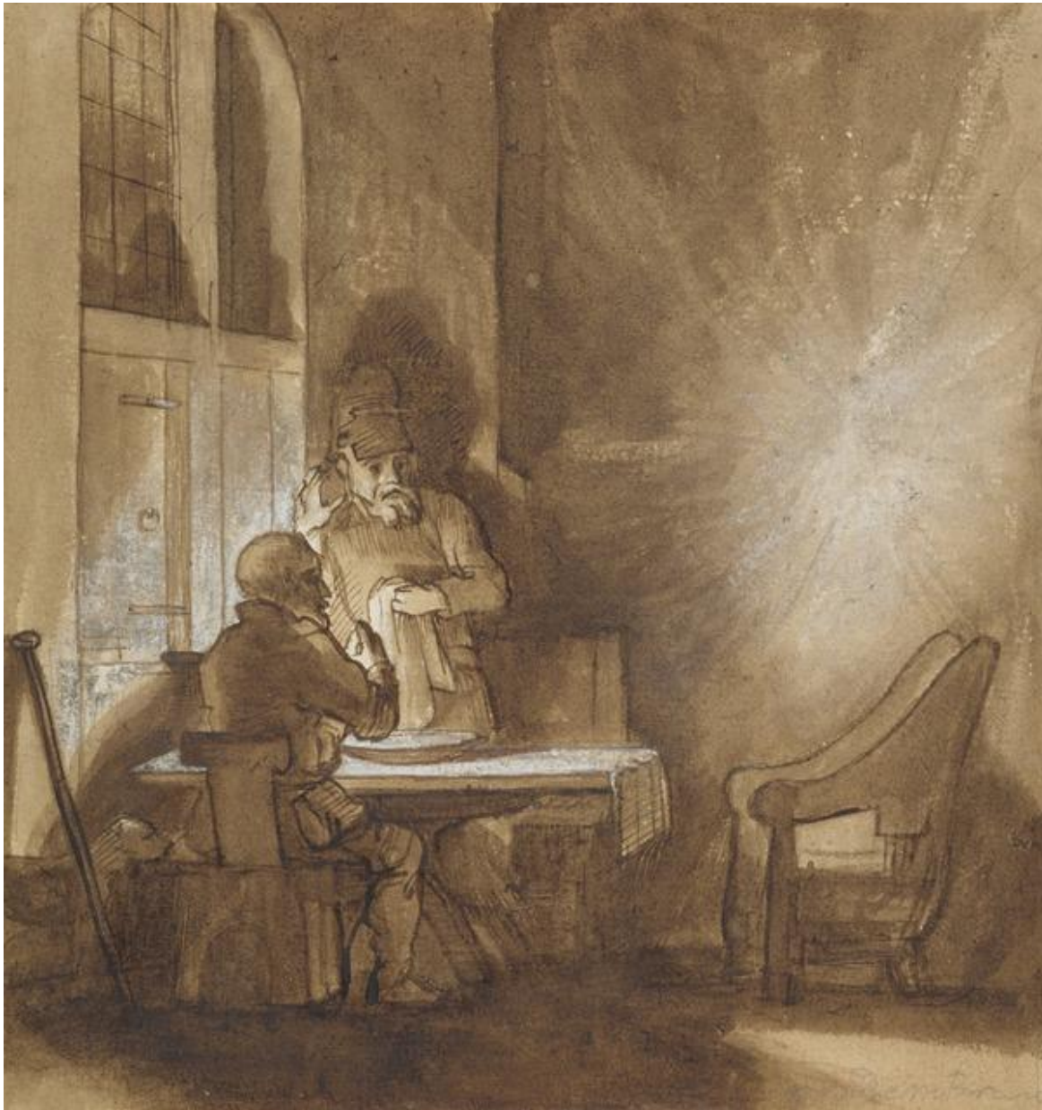
The Supper at Emmaus, artist unknown, National Galleries of Scotland

Eastern Orthodox Christians call today “Bright Monday,” and the whole week following Easter is called “Bright,” bright with the light of the risen Christ. We are post-Resurrection people. We trust that Christ has risen and that we are always accompanied by the Spirit. Yet we strain to experience that which we trust. We are like Jesus’ followers in the post-Resurrection stories: We lament and also hope; we doubt and also trust; we give up and return to whatever is our fishing, and we also are ready to hear a voice calling our name. This week is an opportunity to consider how we might attune ourselves to the holy presence with us. Perhaps being quarantined during this season has allowed us the time to more conscientiously think about what helps us notice God.