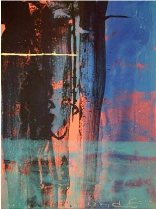
Fragrance at Bethany by Makoto Fujimura

Biblical expectation responds to and includes the shadows. The Light shines in the darkness and is not overcome. Mary experiences joy in Jesus' birth, and also is told by Simeon that "a sword will pierce your own soul...." (Luke 2:35).