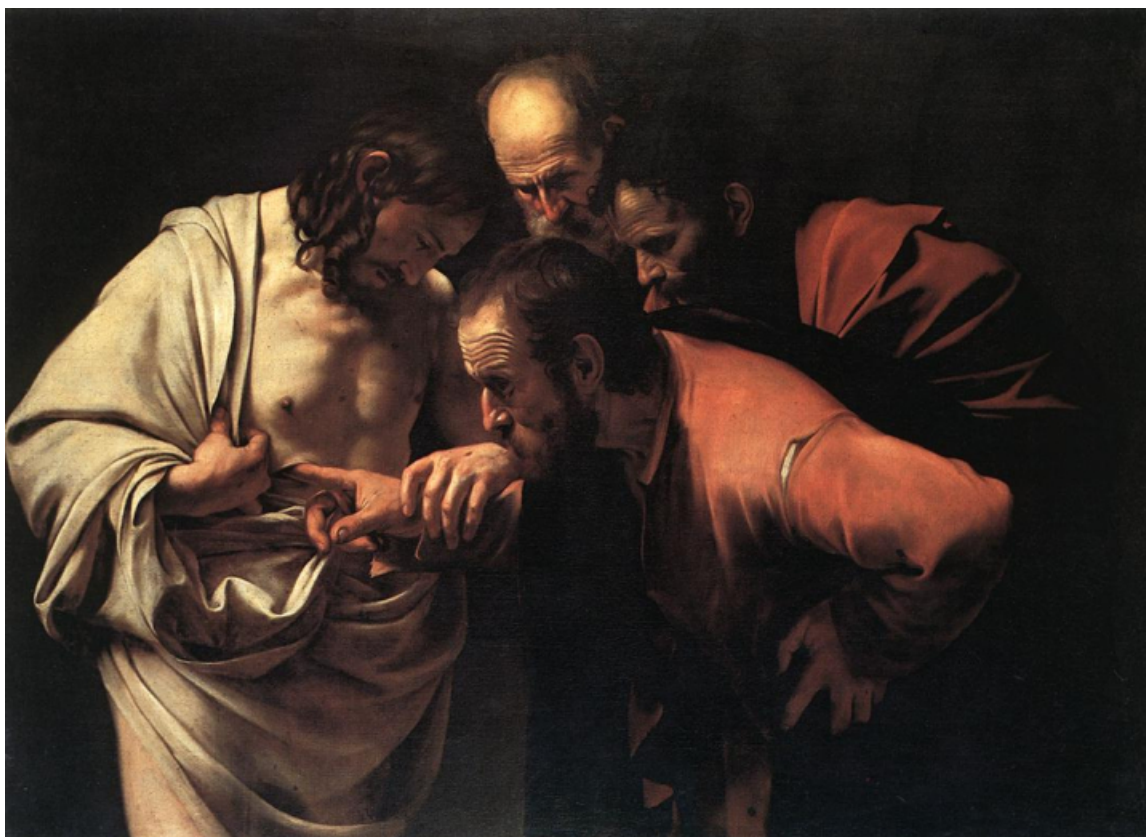
Caravaggio, The Unbelief of Saint Thomas , Bildergalerie de Potsdam (1600-1601)

God is with us. That is what we trust. The disciples came to see Jesus' divinity even in his humanity. We, too, yearn to see divinity present in our lives. Each of the post-Resurrection stories highlights struggles our hearts undergo as we long for God. Peter wanted to be active and helpful. He and his comrade ran to the tomb in their eagerness. Mary wept. Through her tears she could barely make out the identity of the man who called her by name. The couple on the road to Emmaus were bewildered and fearful. They "had hoped," yet now were confused.