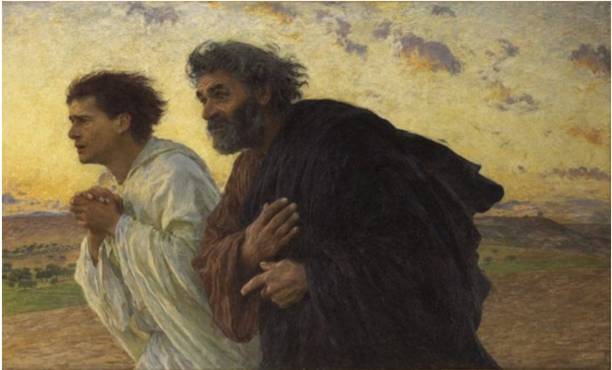
Eugène Burnand, John and Peter Run to the Grave on the Morning of the Resurrection (1898)

Jesus' companions observed the Sabbath after he died. His body lay in the tomb through what we call Holy Saturday, when we're told Jesus descended into hell to proclaim good tidings to the dead (1 Peter 4:6). His companions grieved and prayed their Sabbath prayers in their homes, sheltered-in-place. They were bereft, disillusioned, and vulnerable to persecution; the world was dangerous.