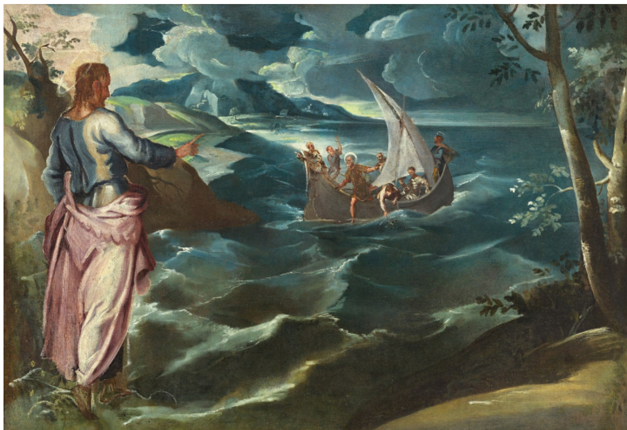
Tintoretto, Christ on Lake Tiberias , National Gallery of Art, Washington DC (1575-1580)

Yet again Jesus seeks the disciples. His friends are grieving his absence and seeking a new normal. On this day they've left the shelter of their homes and returned to work, but work doesn't go well—no fish! The disciples are tired, they've suffered, and the world feels threatening. These circumstances might resonate with the feelings of many people around the world now as we tentatively enter our post-pandemic lives.