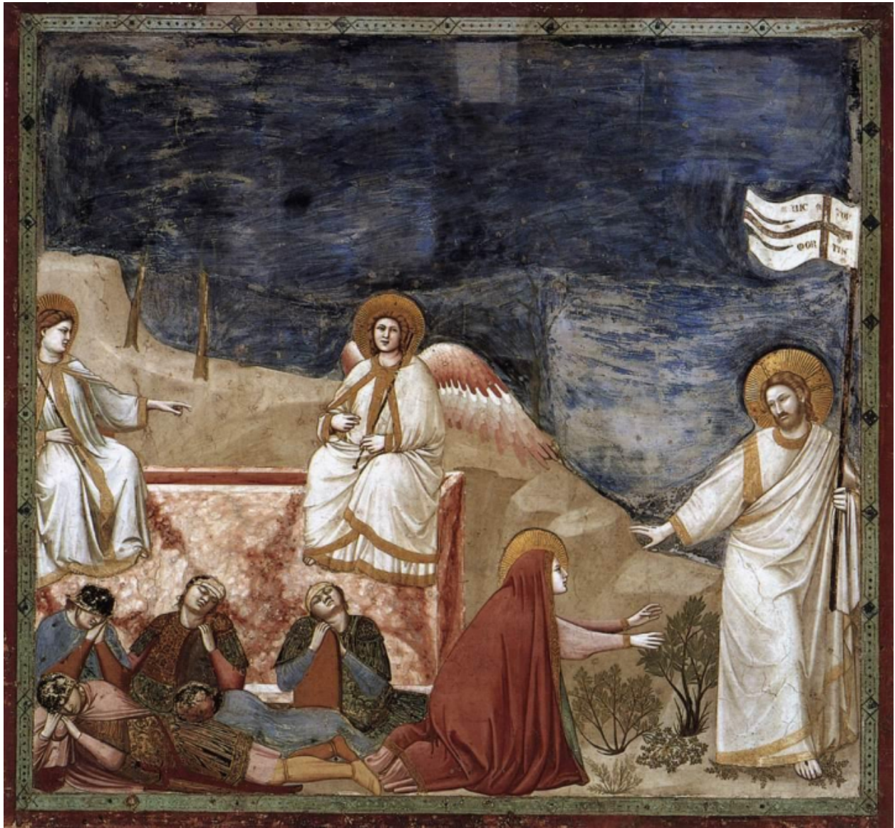
Giotto, Noli me tangere (Don't touch me) , Chapel of the Scrovegni, Padua, 1303-1305

Mary Magdalene is the first person the Gospels cite as seeing the risen Christ. Like the angels had done when she peered into the tomb at them, Jesus asks about her weeping. In the Book of Acts (1:24, 15:8) we're told that God is a cardiognostician , a knower of hearts. God seeks to know our hearts and have a heart to heart relationship with us. No matter how extreme the circumstances, the Holy One pays attention to what is deepest