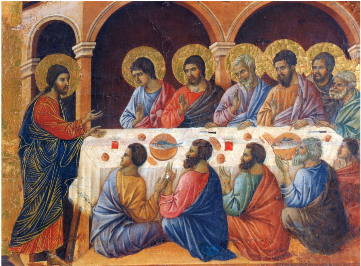
Duccio di Buoninsegna, Apparition of Christ in the Circle of His Apostles , Museum of the Cathedral of Siena,